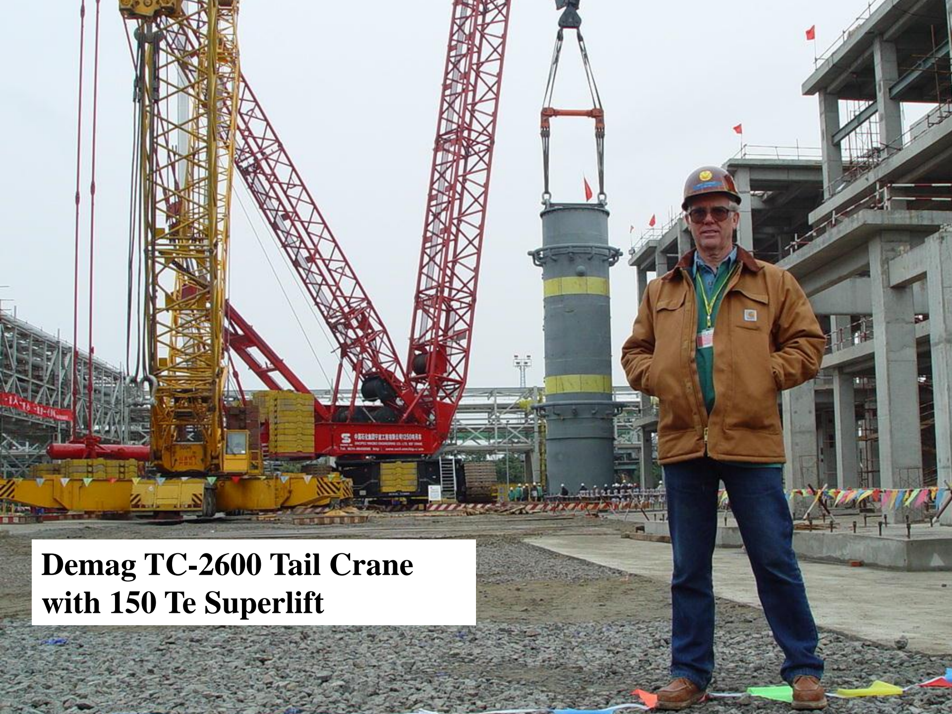
Demag TC-2600 Tail Crane with 150 Te Superlift